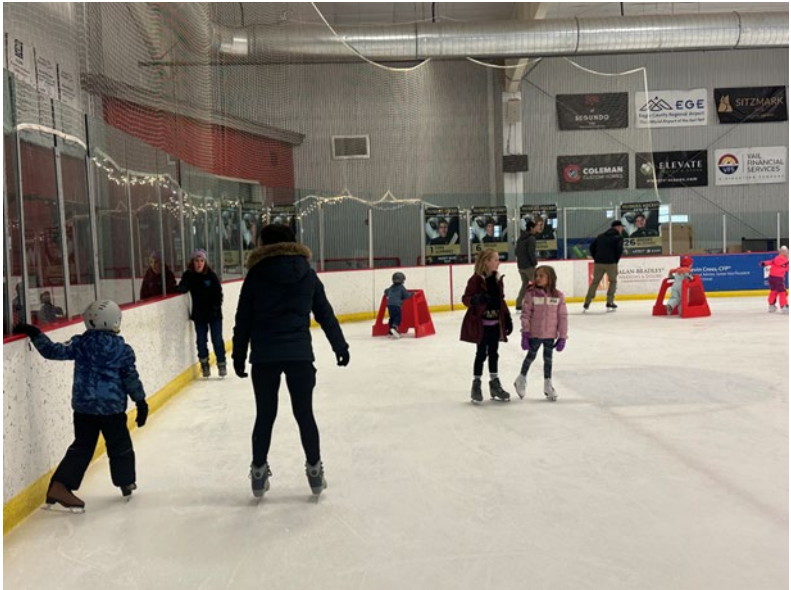
Celebrate the Olympics – FREE SKATE!