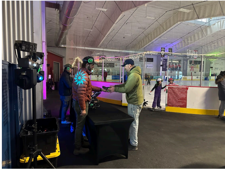
Silent Disco Skate – would LOVE to do this again!